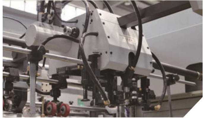
Taiwan OEM feeder

Taiwan OEM Gearbox, Ensure minimum space between the Input and output of drive from gearbox in order to maintain Gripper accuracy.